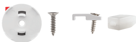
Mounting brackets and screws x91