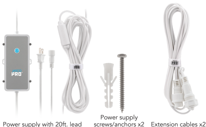
Power supply with 20ft. lead